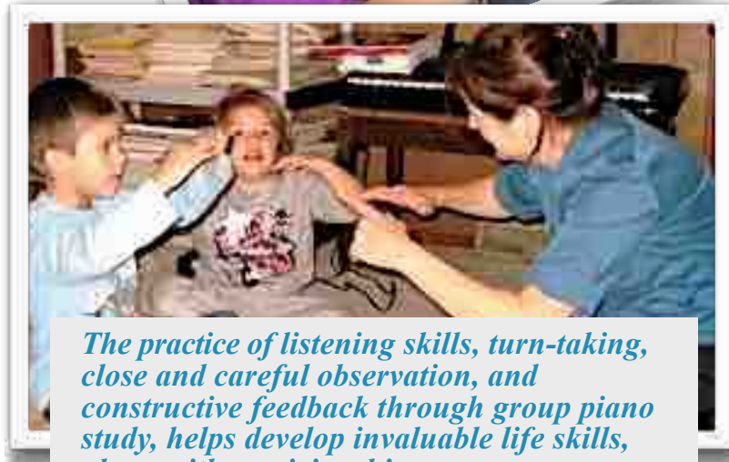
The practice of listening skills, turn-taking, close and careful observation, and constructive feedback through group piano study, helps develop invaluable life skills, along with musicianship.

interactive learning. Sports activities, though a potential venue for peer teaching and learning, don’t always focus on guiding team members to carefully observe and then provide sensitive feedback on each others’ performances.