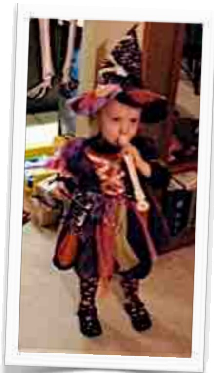
Halloween Open Class Van Arsdale Studio